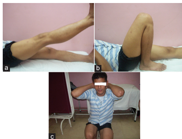
Range of motion.